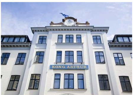
Hotel Kong Arthur